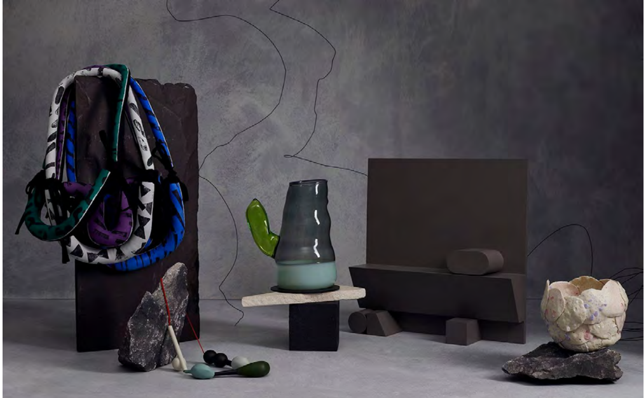
Above: Beyond Typology Showcase