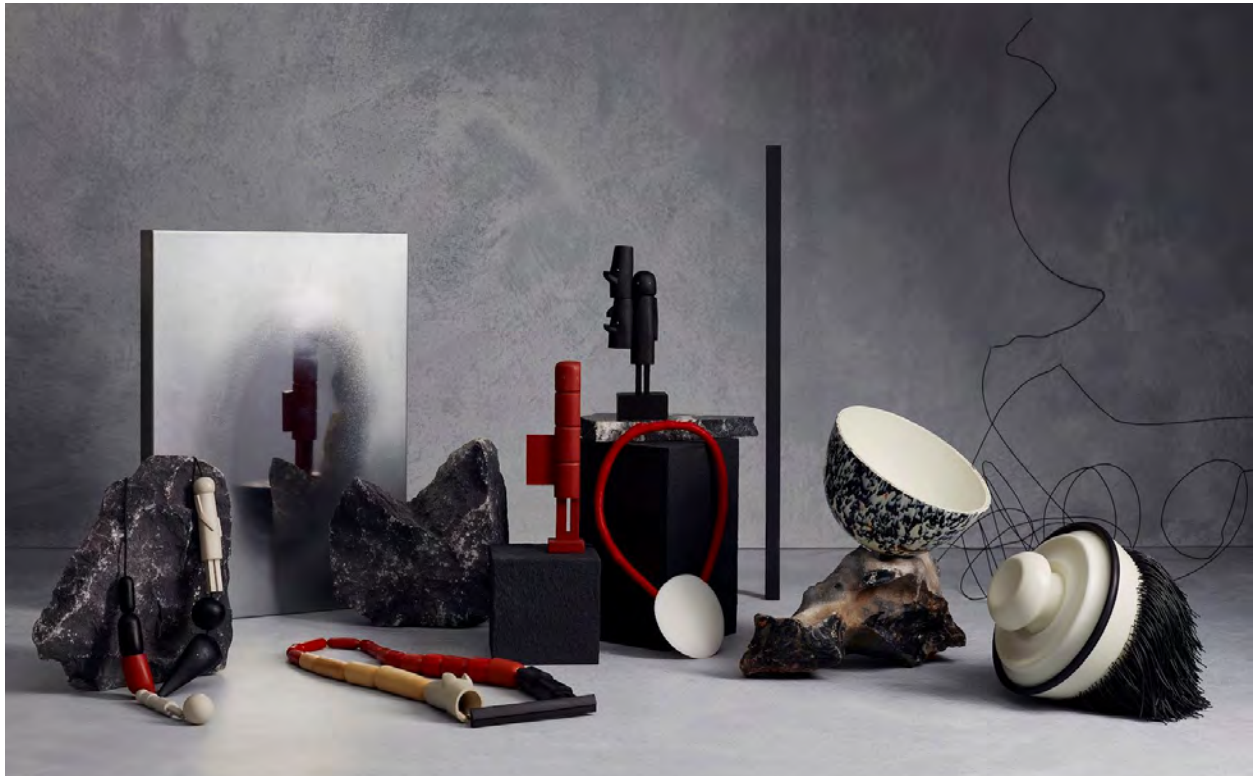
Above: Beyond Typology Showcase